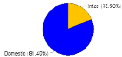
New NARs--FY2002 Intco as percentage of PCC